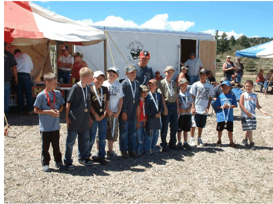
Boys Cub Bowhunter winners