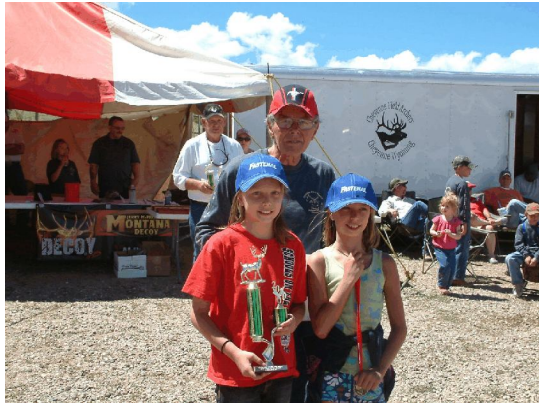
Girls Cub Open winners