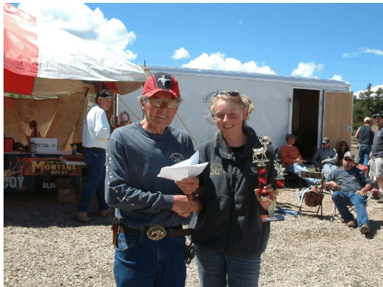
Girls Young Adult Bowhunter winner