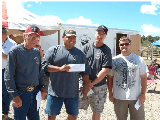
Men's Bowhunter (First Flight) winners