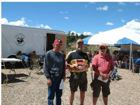
Men's Bowhunter Limited winners