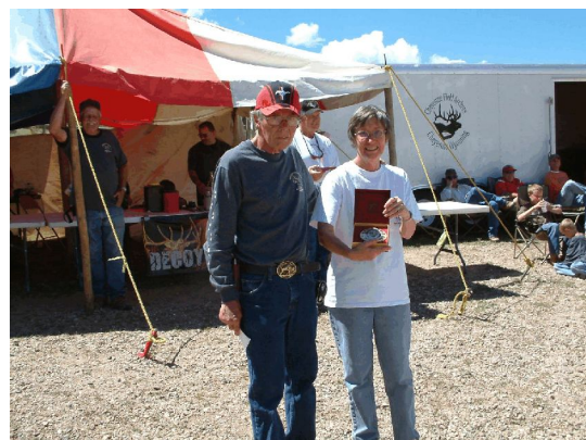
Womens Senior Traditional