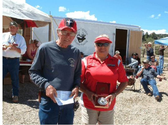
Womans Senior Open