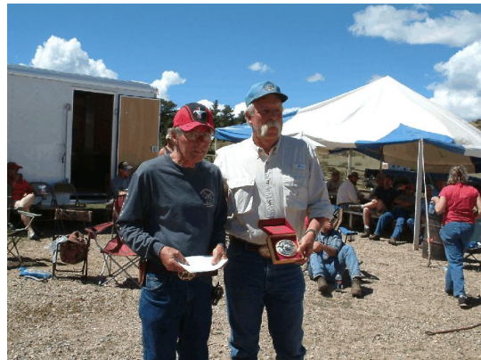
Men's Senior Traditional winner