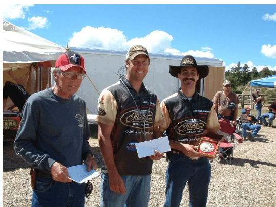
Men's Open winners